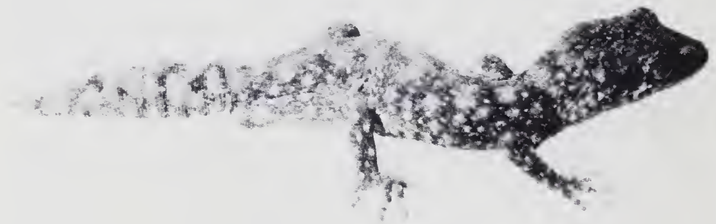
Plate 2. A Diplodactylus polyophthalmus from Mt Dale.

Dorsally and laterally dark reddish brown, spotted with pale reddish brown. Spots on head, back and tail larger, less circular and often less sharply defined than those on sides; paravertebral spots of one side often confluent with those of other side to form transversely or obliquely elongate blotches; dorsal spots occasionally so large as to leave only a reticulum of ground colour. Lateral ground colour continuing forward as a dark stripe through temples and orbit to lores. Upper lips dark. Under surfaces white, each granule bearing a dark central dot.